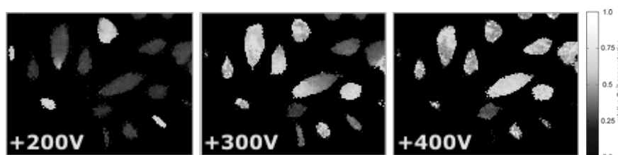
Figure 2. Cells stained with Fura-2AM and exposed to electric pulse with increasing amplitude.

Using a Cliniporator™ device, deliver one electric pulse of 100 \mu\text{s} with voltages varying from 150 to 300 V. Immediately after the pulse, acquire two fluorescence images of cells at 540 nm, one after excitation with 345 nm and the other after excitation with 385 nm. Divide these two images in MetaFluor to obtain the ratio image ( R = F_{340}/F_{380} ). Wait for 5 minutes and apply pulse with a higher amplitude. After each pulse, determine which cells are being electroporated (Figure 2). Observe, which cells become electroporated at lower and which at higher pulse amplitudes.